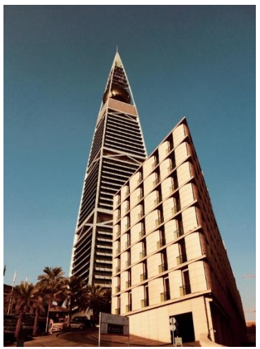
The Al Faisaliyah Center, designed by Norman Foster, was Saudi Arabia's first high-rise building in 2000.