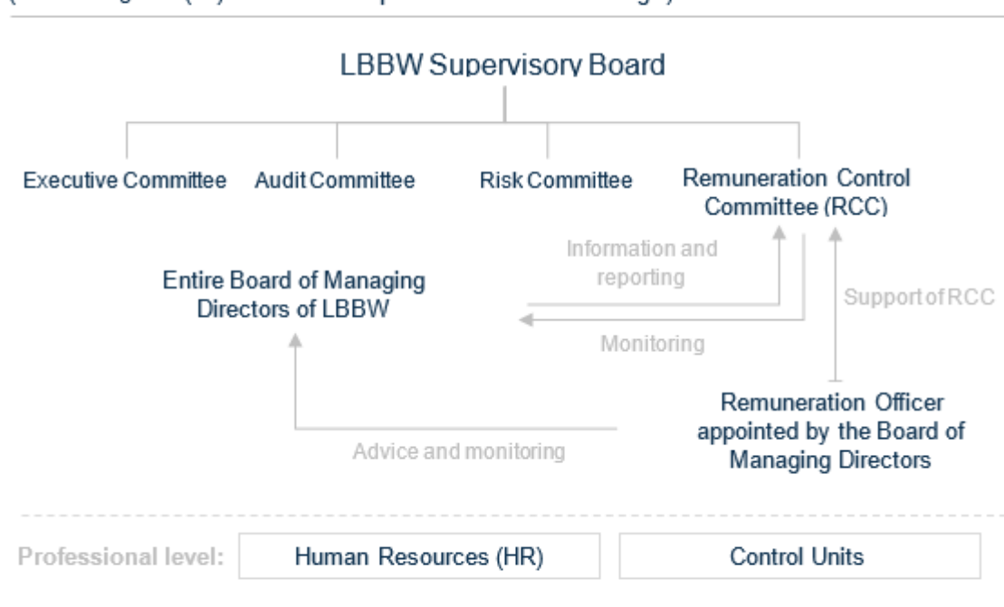
Remuneration governance structure at LBBW (based on § 25d (12) KWG and the provisions of InstitutsVergV)

As a major institution as defined in Section 1 (3c) KWG, LBBW is obligated to meet not only the requirements pertaining to the structure and disclosure of remuneration, but also the requirements of remuneration governance.